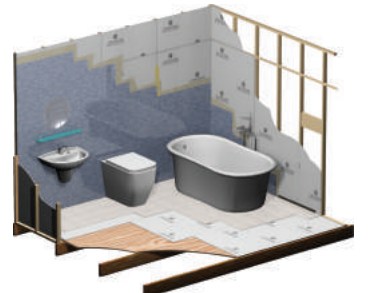
Large Sheet Tile Backer