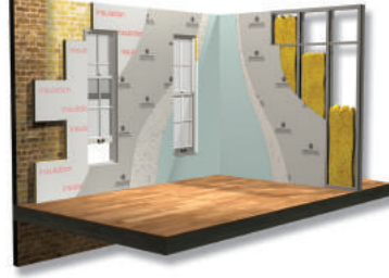
Fire Rated Solid Wall Linings, Stud Partitions & Loaded Floor/Ceilings